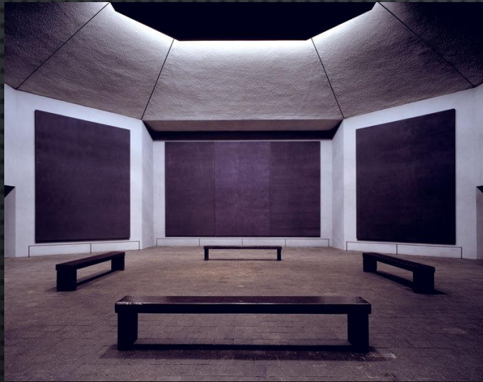
ROTHKO CHAPEL, HOUSTON